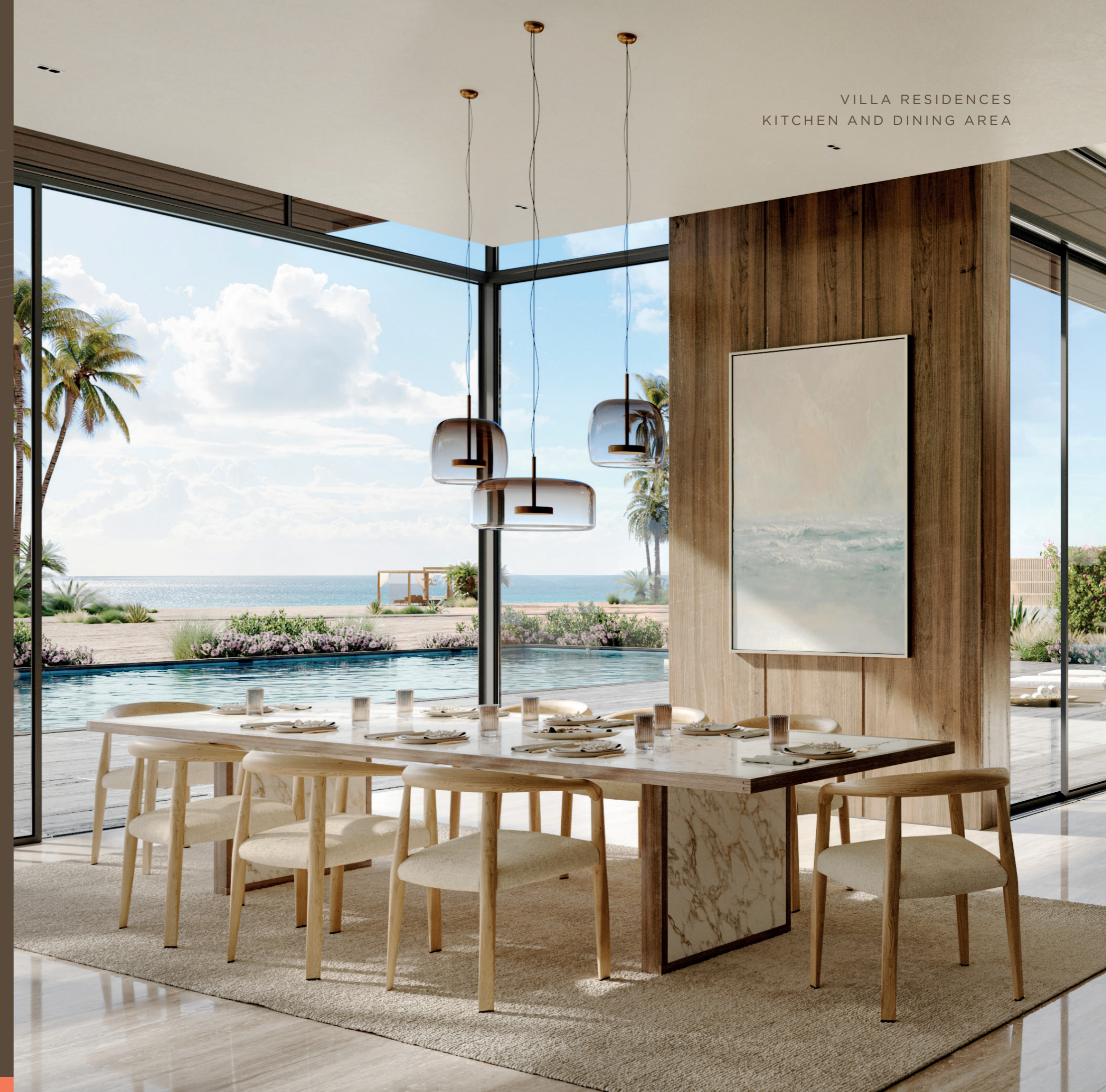
VILLA RESIDENCES KITCHEN AND DINING AREA