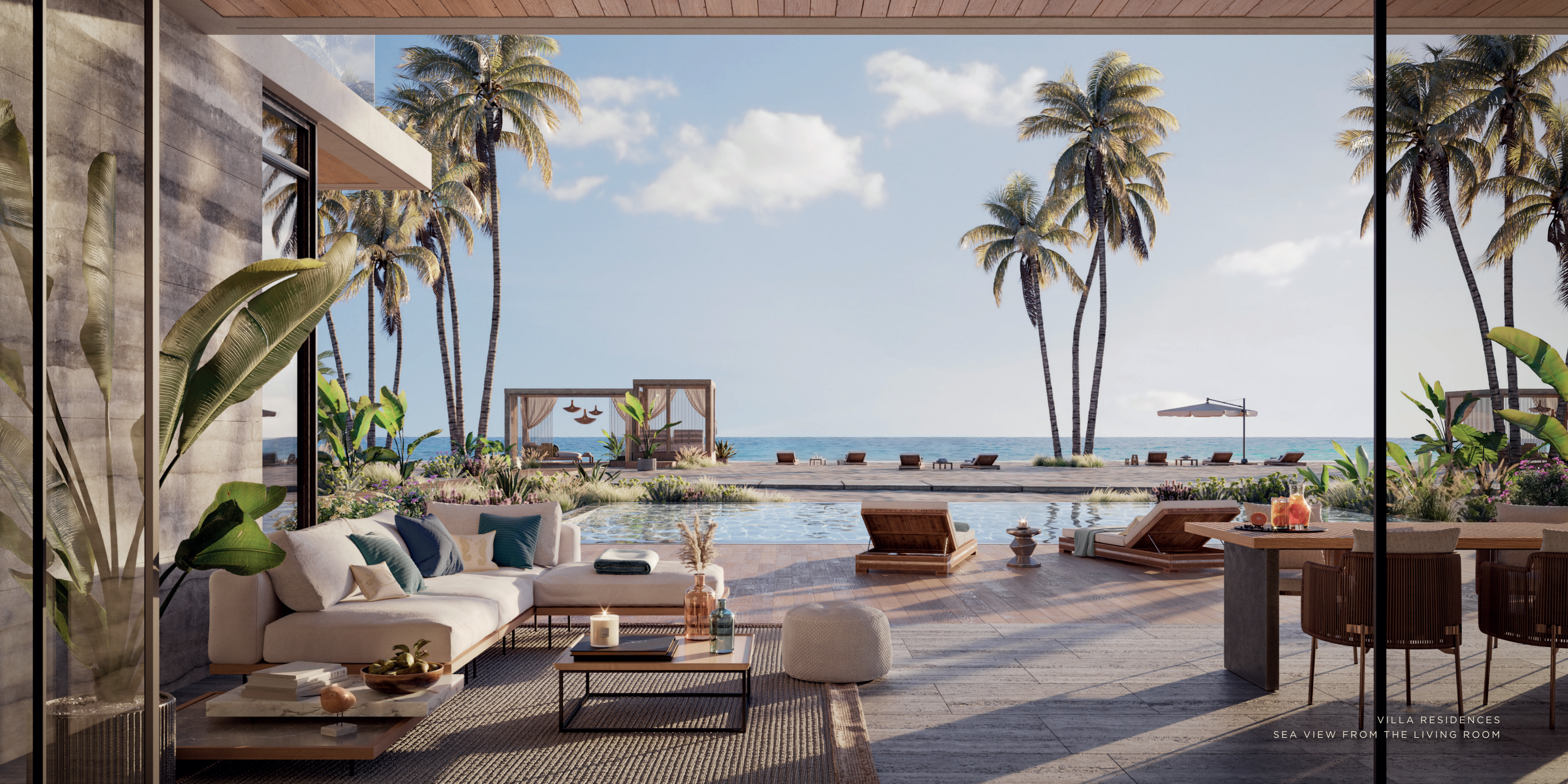
VILLA RESIDENCES SEA VIEW FROM THE LIVING ROOM