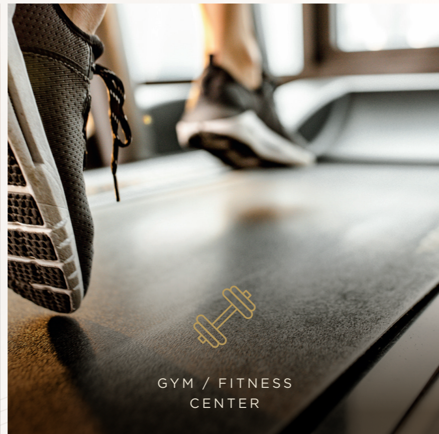
GYM / FITNESS CENTER